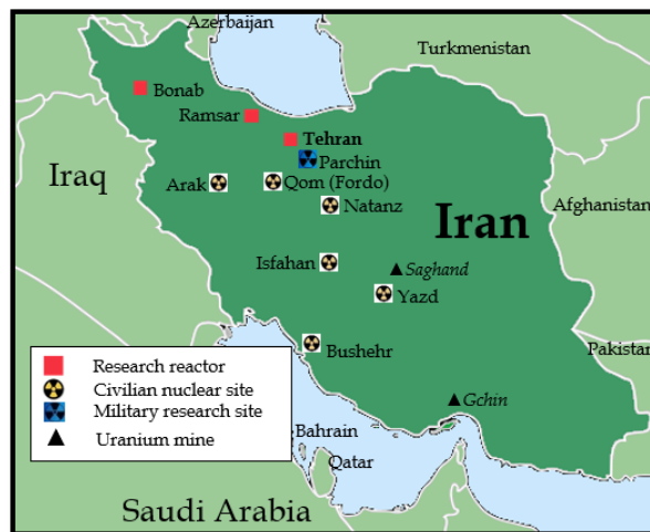
Figure 2. Iran's Nuclear Program

Iran's Nuclear Program: The international community, led by the United States, imposed sanctions on Iran aiming to curb its nuclear program, as shown in Figure 2 [8]. The sanctions targeted Iran's oil exports and financial transactions, leading to a significant drop in its GDP and a sharp devaluation of its currency. A statistical analysis utilizing interrupted time series models indicates a direct correlation between the imposition of sanctions and the decline in Iran's economic indicators. However, the 2015 Joint Comprehensive Plan of Action (JCPOA) illustrated the potential for sanctions to bring about diplomatic negotiations, as evidenced by Iran's agreement to curb its nuclear activities in exchange for lifting some sanctions.