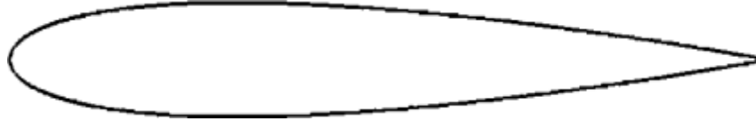
Figure 2. NACA 0012 airfoil.

first fighter that can fly at supersonic speed. The airfoil is designed with less thickness and less curvature of the surface curve, so it is less affected by shock wave drag at supersonic speeds. The round head is beneficial to avoid the occurrence of head separation zone and the loss of suction peak at the head, so as to improve the lift drag ratio of the aircraft. Airfoils are often cut in two-dimensional sections to study aerodynamics and to evaluate air forces or surface pressure in practical applications [3]. The shape of the NACA 0012 airfoil is shown in the Figure 2.