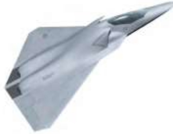
Figure 7. Conceptual sketch of the next generation fighter announced by Boeing [17].