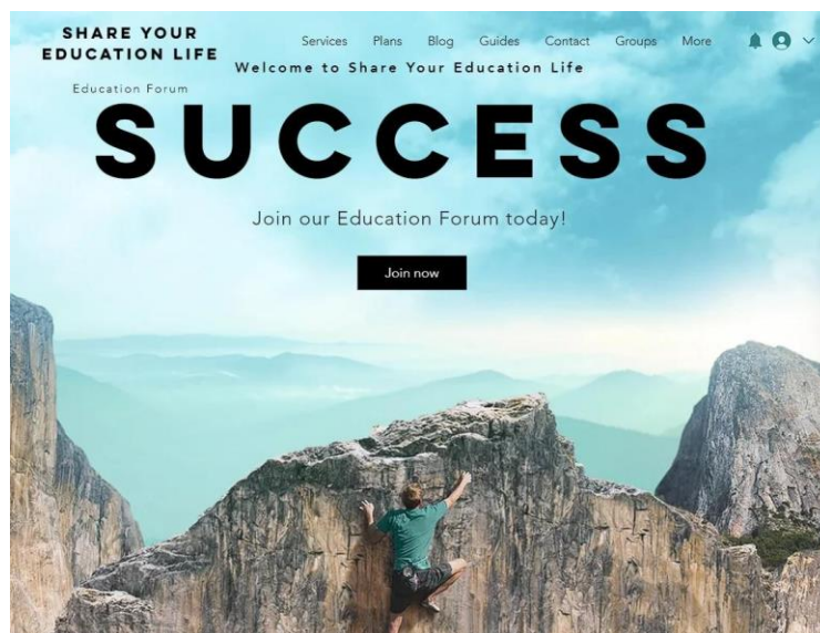
Figure 4. Improved homepage Desktop version

3.4.5. Sitemap Creation. To effectively organise and navigate a website, it is essential to have a roadmap, which is a file that contains the most significant sites [24]. This hierarchical map makes it simple for users to navigate their way around the content that is contained on the website. It is necessary for you to have a sitemap for Wix to assist search engines in locating and processing your page (Figure 4).