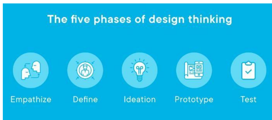
Figure 1. The five phases of design thinking

The Design Thinking Method is used in the web design process. This is a human-centered, repetitive method that tries to understand users, question assumptions, and reframe problems to find new strategies and answers that might not be obvious at first. This way puts a lot of weight on really knowing users to come up with solutions that make the whole experience better for them [8]. To effectively utilise the online design method of Design Thinking, it is important to possess a profound comprehension of the folks for whom you are developing goods [8]. This technique not only guarantees a visually beautiful user interface but also assures optimal functionality and meets the specific requirements and preferences of the users involved. Figure 1 illustrates the division of the website development process into five main components. An essential element of the Design Thinking approach is its continuous nature. The process involves sequentially engaging in empathy, defining, ideating, prototyping, and ultimately testing [9]. These are the five essential phases of the procedure. The iterative method is advantageous for user interface design since it guarantees that design choices are influenced by both user feedback and the latest industry trends [10].