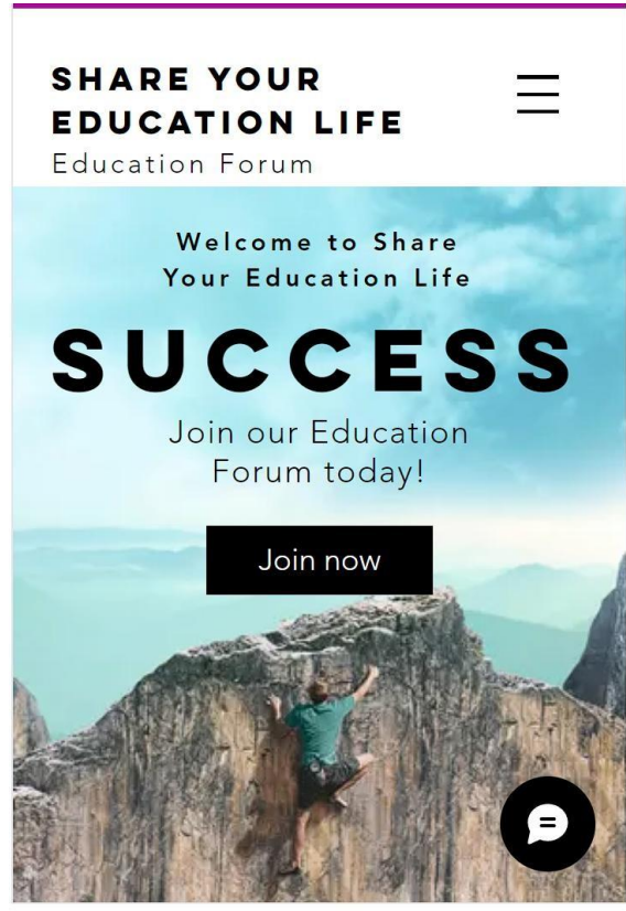
Figure 3. Mobile site from https://17816334690.wixsite.com/education-blog

3.4.5. Sitemap Creation. To effectively organise and navigate a website, it is essential to have a roadmap, which is a file that contains the most significant sites [24]. This hierarchical map makes it simple for users to navigate their way around the content that is contained on the website. It is necessary for you to have a sitemap for Wix to assist search engines in locating and processing your page (Figure 4).